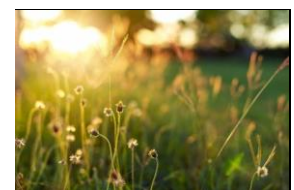
Hot Sunny Days

The weather has again taken us by surprise this week. For some it has been glorious and for others it has been too hot and uncomfortable. By Wednesday pupils and staff were struggling. It did not matter how much cold water you drank or how many fans were in the classroom/office it was too hot. The pupils were very sensible though and tried to stay in the shade when possible.