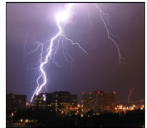
Thunder & Lightning

It is a statutory requirement for us to update pupils' details on an annual basis. The 'Blue Forms' provide us with up to date contact details, medical information and parental consent. Without a parent's or carer's consent, pupils are not allowed to leave the school premises for local trips and activities like swimming or the park. Please ensure you complete and return the form. If you have mislaid the form or would like another copy, please contact the school office.