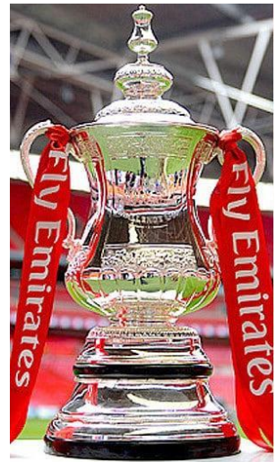
FA Cup Semi Final Tickets

On Thursday 30th March from 7-10pm there will be a Quiz Night run by Collett Innovative industries (Aspen class) and Warriors ABC with proceeds going towards new sports equipment that will benefit both the school and the boxing club. Tickets are £10 each which includes food (bring your own drink) and we are hoping for 10 teams of 10 people. There will be a raffle and prizes for the winning team. The defending champions are the school teachers.