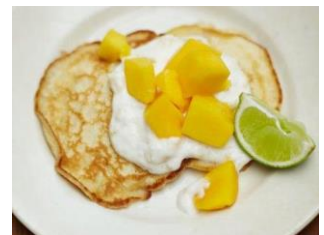
Jamie Oliver's One Cup Pancakes Jamie's Home Cooking Skills