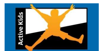
Sainsbury Active Kids