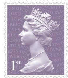
Royal Mail Stamp