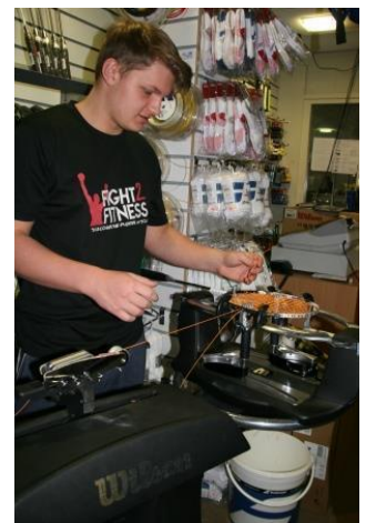
Restringing a tennis racket