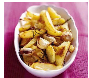
Lemon and Rosemary Potato Wedges BBC Good Food