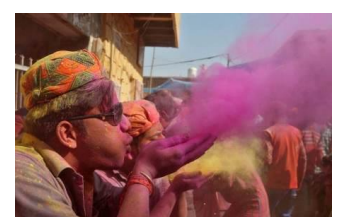
Holi, Hindu Spring Festival of Colour