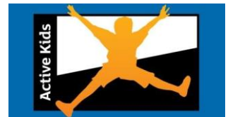
Sainsbury Active Kids