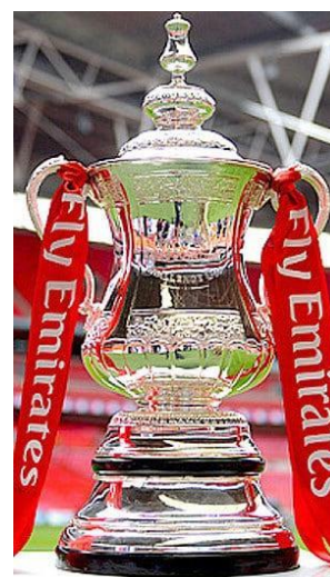
FA Cup Semi Final Tickets

Juniper Class walked up to the butchers at Warners End on Monday to collect two frozen Lamb hearts. They examined them to see how the blood is pumped around the heart. They also had a very interesting lesson on hormones this morning.