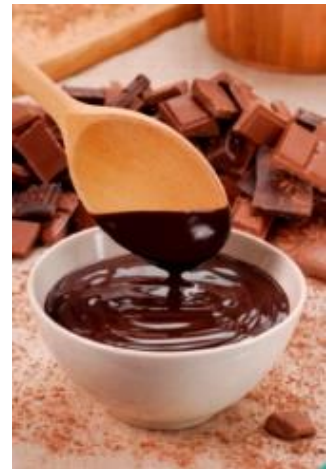
How temperature affects chocolate