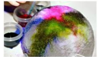
Combining Art & Science

https://artfulparent.com/childrens-artful-science-experiments