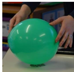
Balloon on many pins

Pine and Olive class explored surface area. They rolled a balloon over a single pin and it burst, we then rolled a balloon over several pins and it did not burst. The pressure from a single pin is all in one area of the balloon which is why it pops, but when you roll the balloon of several pins the pressure is shared across the balloon so it doesn't pop.