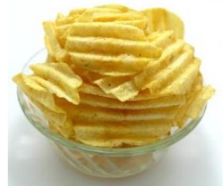
Name the Flavour